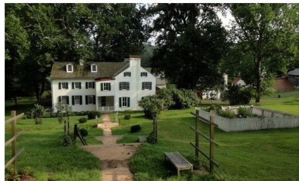
The Ironmaster's House and Historic Garden