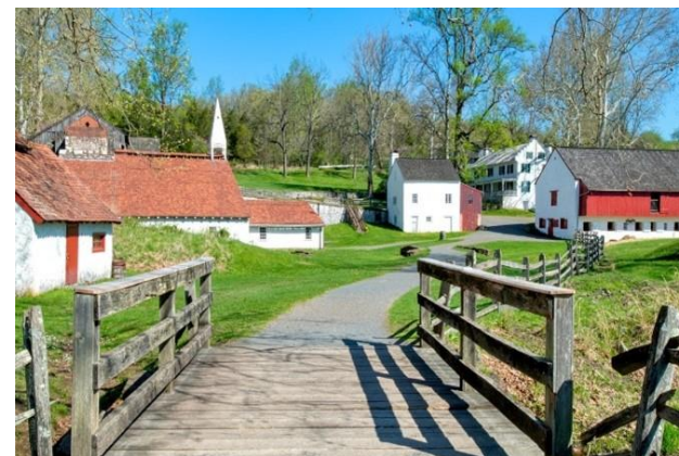
Hopewell Furnace Village

Join the Friends of Hopewell Furnace and help support one of America's great National Historic Sites