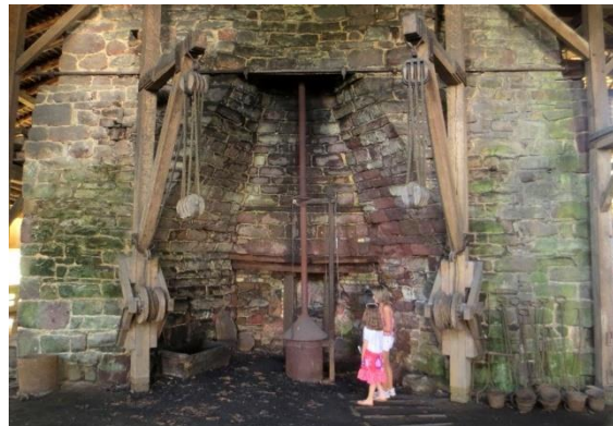
Restored Furnace Stack in the Casting House