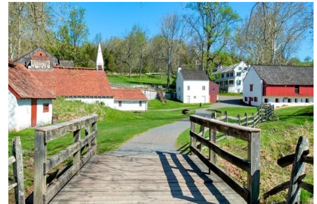
Hopewell Furnace Village

Join the Friends of Hopewell Furnace and help support one of America's great national historic sites