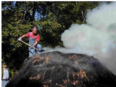
Colliers making charcoal